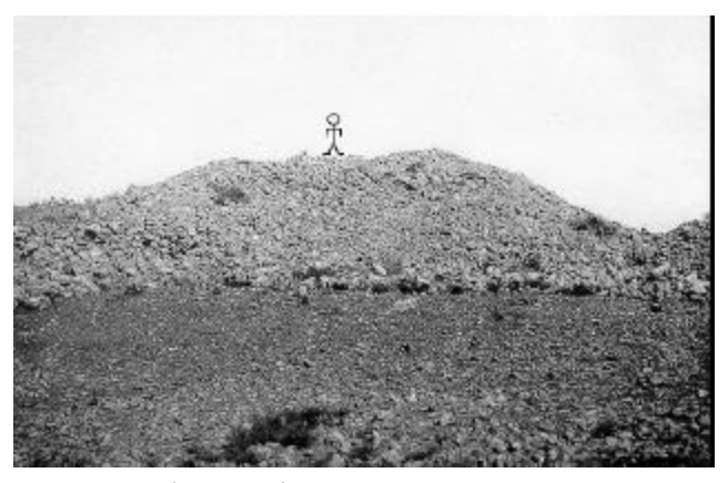
The heap of stones from closer range. I have added a six-foot stick figure for approximate scale. From Marquet-Krause Plate I.

of factual information about history available. Such information can, and should, be used to illuminate our understanding of the Bible, and to strengthen and defend the historical reliability of the Bible.